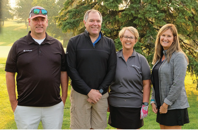
2022 - The Ohio Health Team